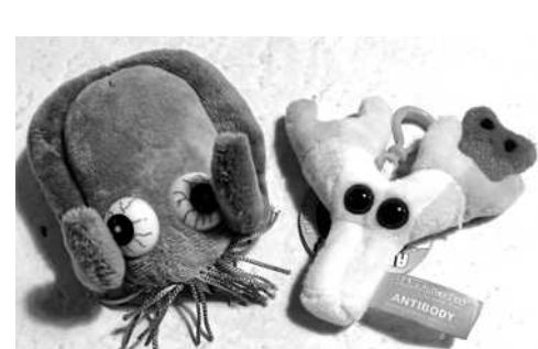
A little toy virus kept in line by a little toy antibody: This week's 2nd prize.

Submit up to 25 entries at wapo.st/enter-invite-1462 (no capitals in the Web address). Deadline is Monday, Nov. 22; results appear Dec. 12 in print, Dec. 9 online.